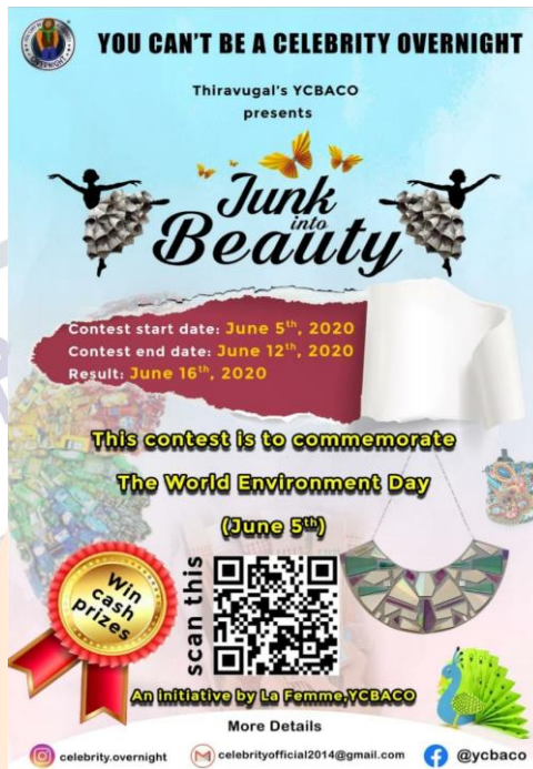
1. Contest Announcement