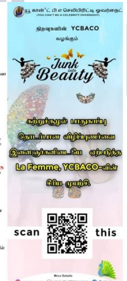
3. Rules (Tamil)